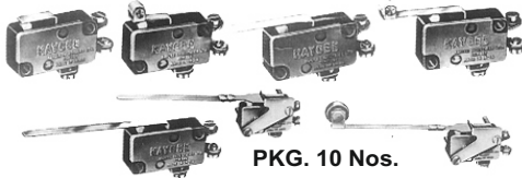
PKG. 10 Nos.